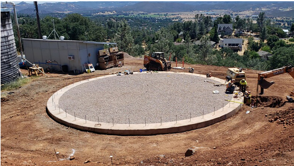
▲ Contractors forming the base of the first new tank.