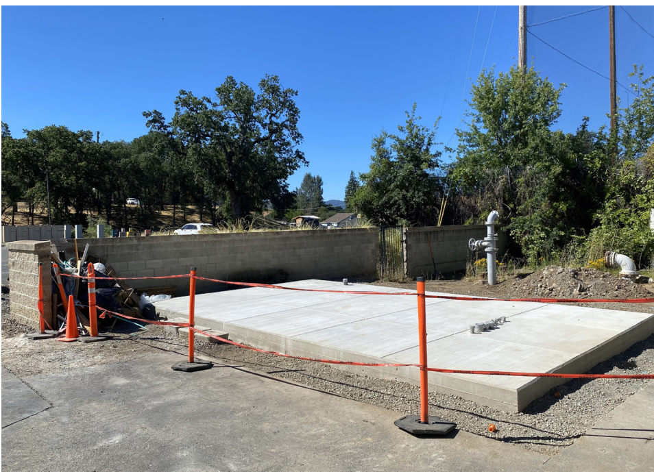
▲ The new concrete pad for the first generator site located next to CSD's office on Hartmann Road.

Both tanks are expected to be completed by the end of this year. As work continues, please be aware of the increase in activity in the area. Be sure to abide by all traffic signs and flaggers for everyone's safety.