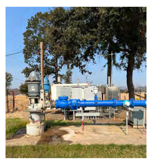
Well 2 Well 2

will be summarized in a preliminary design memorandum.